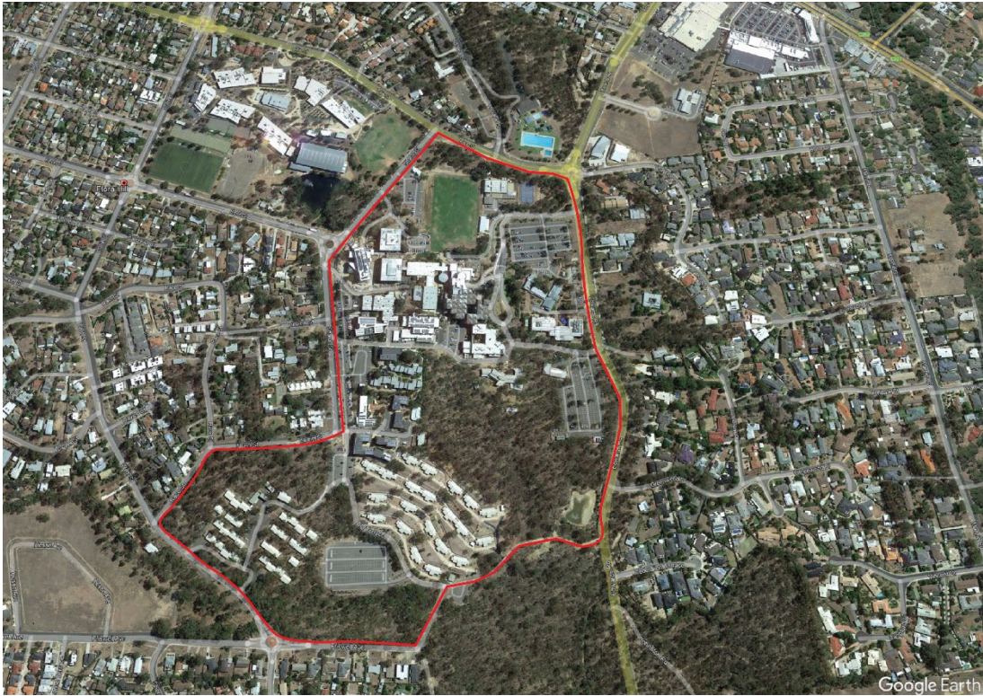
Figure 2: Property title of Bendigo Campus Precinct 2