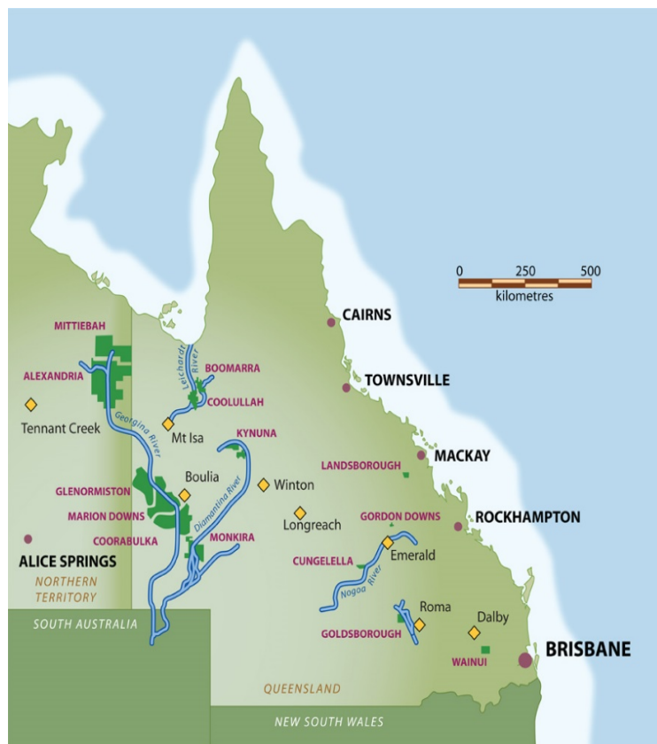
Figure 1. NAPCo Properties

The North Australian Pastoral Company (NAPCo) is one of Australia’s largest and privately owned cattle companies, commencing operations in 1877. NAPCo currently manages over 6.1 million hectares, in both Queensland and the Northern Territory including; Alexandria, Boomarra, Coolullah, Coorabulka, Cungelella, Glenormiston, Goldsborough, Gordon Downs, Kynuna Station, Landsborough, Marion Downs, Monkira, Mittiebah & Portland Downs. NAPCo also operates the award winning Wainui Feedlot and Farm on the Darling Downs. Combined, this property portfolio supports approximately 200 000 head of cattle.